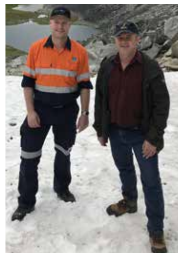
In the field in Yukon, Canada, with CSA

Finally, he points out, the tie-in can aid with periodic independent audits and health checks to ensure processes are being followed, risks are being monitored and dealt with, ▶